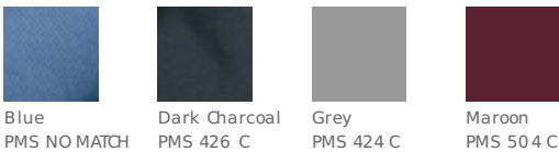
Blue PMS NO MATCH Dark Charcoal PMS 426 C Grey PMS 424 C Maroon PMS 504 C